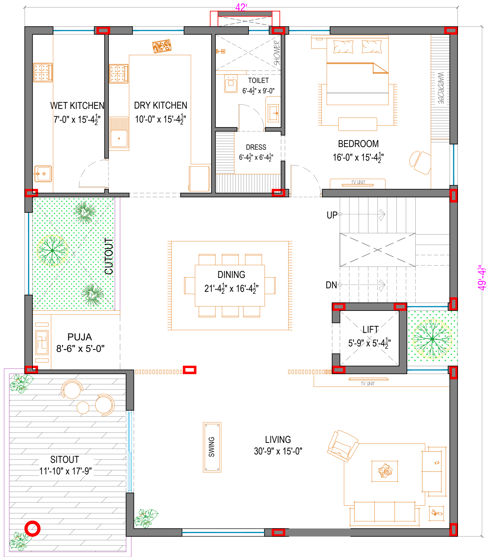
FIRST FLOOR PLAN NORTH ROAD